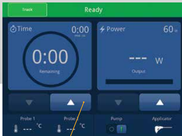
Simple Operating Parameters of Time and Wattage